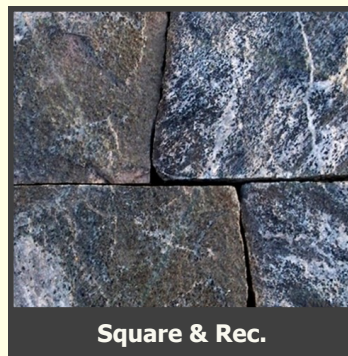
Square & Rec.