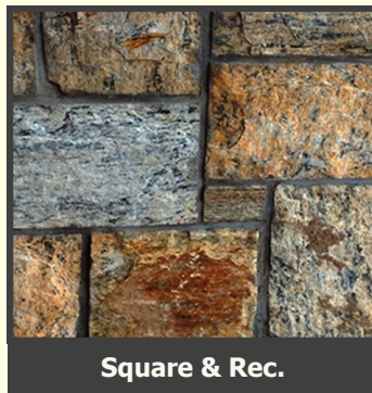
Square & Rec.