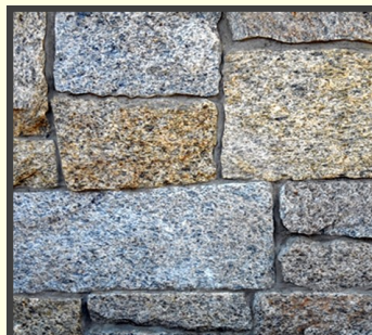
Square & Rec.