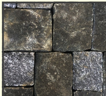
Square & Rec.